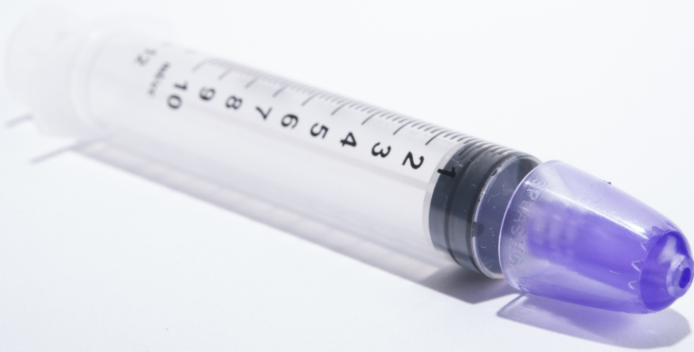
Nasal Irrigation Adapter